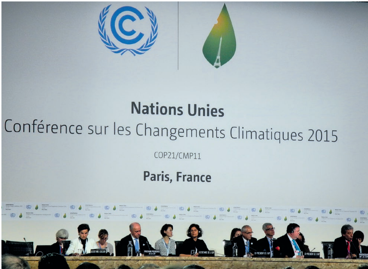
Laurent Fabius, the President of COP21, and Christiania Figueres, Executive Secretary of the UNFCCC, open the COP21 climate conference in Paris. The internationally binding agreement was signed by 195 parties.

These three goals clearly demonstrate that the Paris Agreement is different from its predecessor - the Kyoto Protocol - as it no longer merely focuses on mitigation and climate protection. In fact, the Paris Agreement is an attempt to leave behind the sectorial niches of the past and to pave the way towards a socio-ecological transformation and a climate-friendly world.